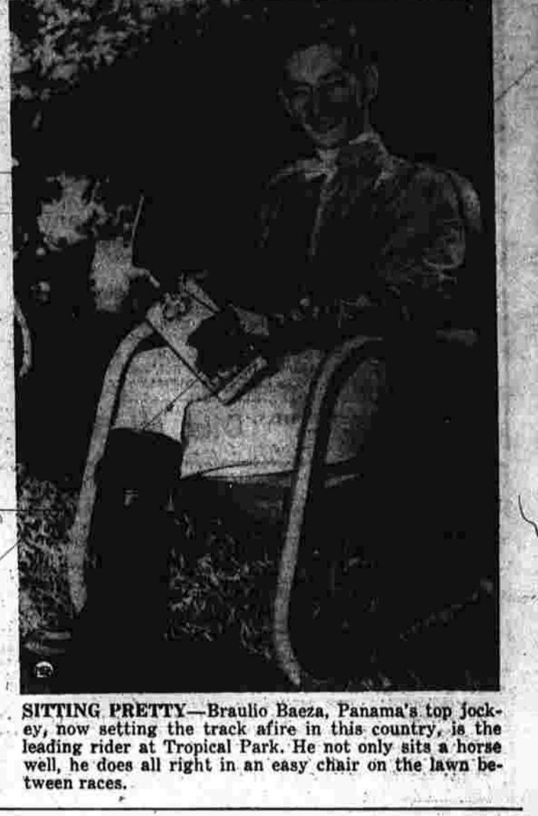
SITTING PRETTY—Bruno Bascia, Panama's top jockey, now setting the track after in this country...

Guaranteed 24 Months, 27 Months, 36 Months. Now! Goodyear Auto Tires give you more protection than ever before!